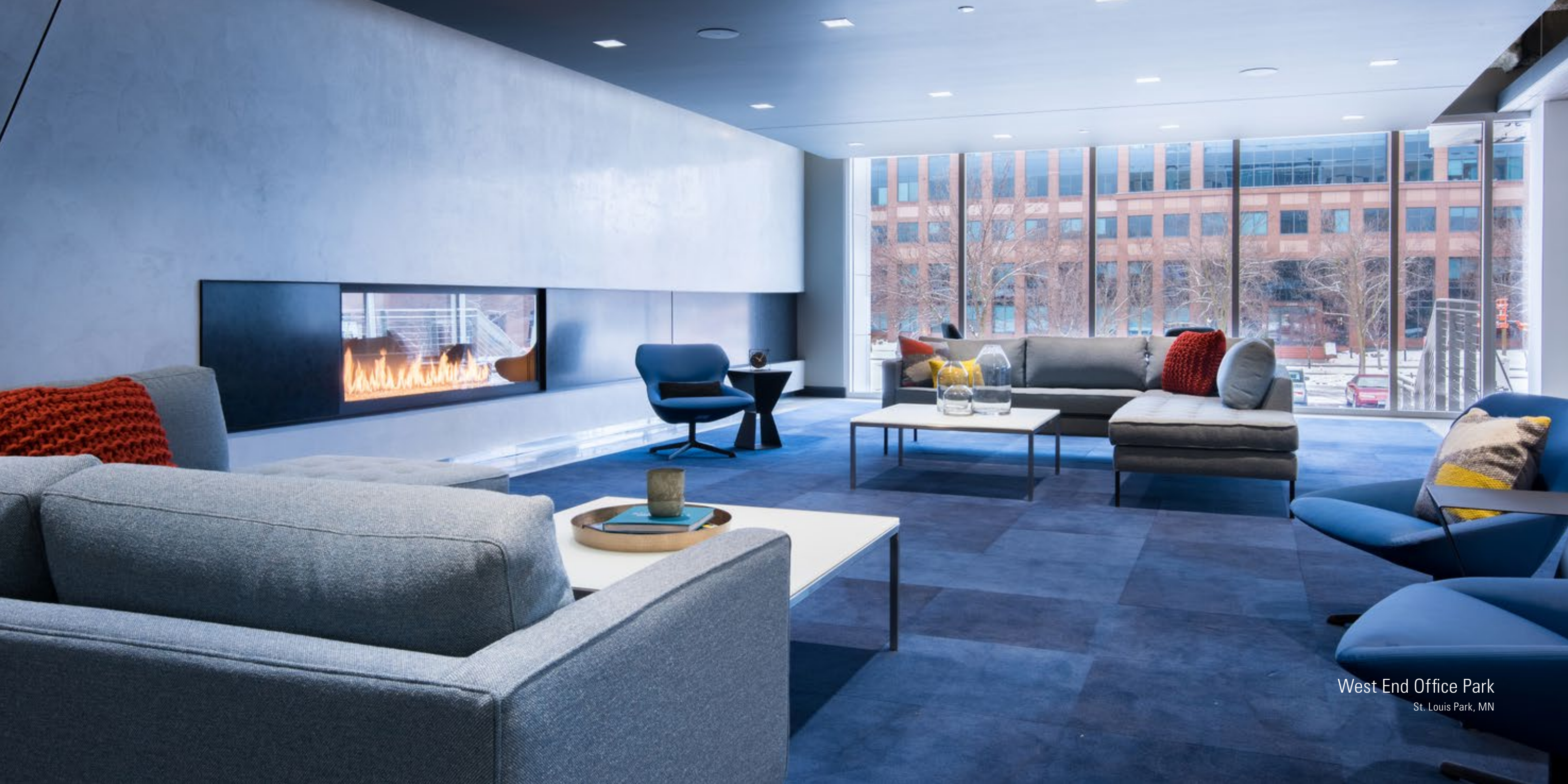
West End Office Park St. Louis Park, MN