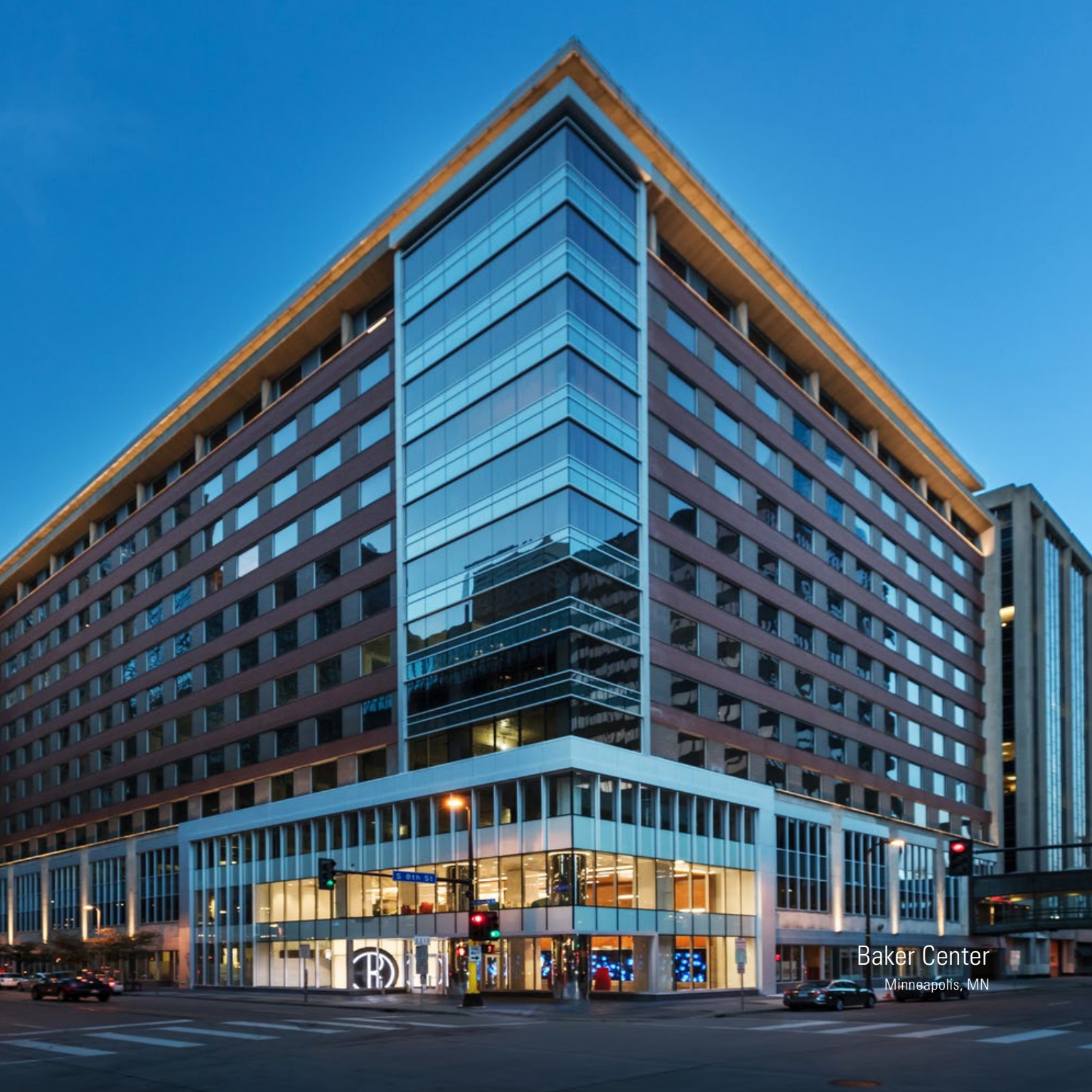
Baker Center Minneapolis, MN