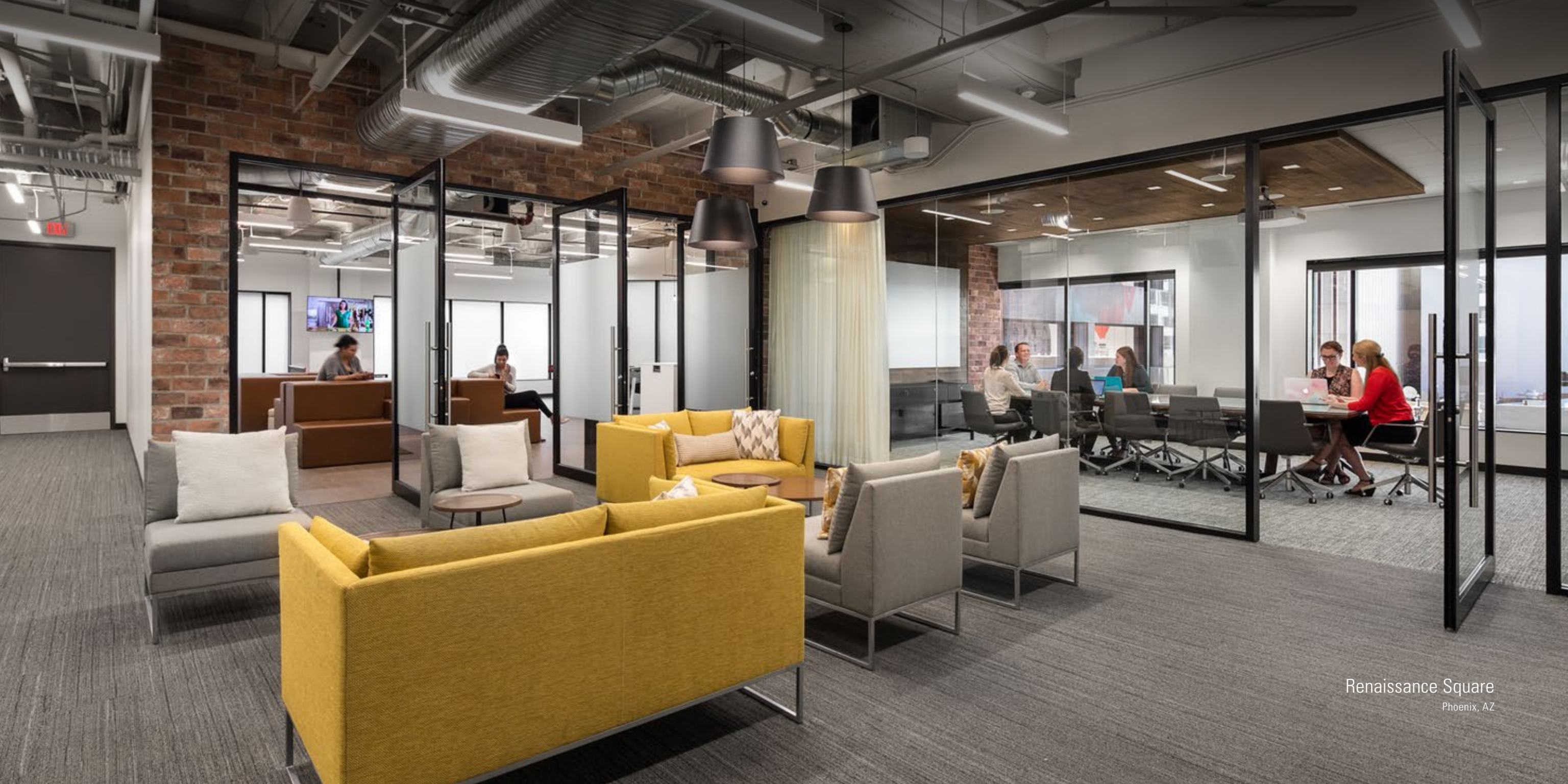
Renaissance Square Phoenix, AZ