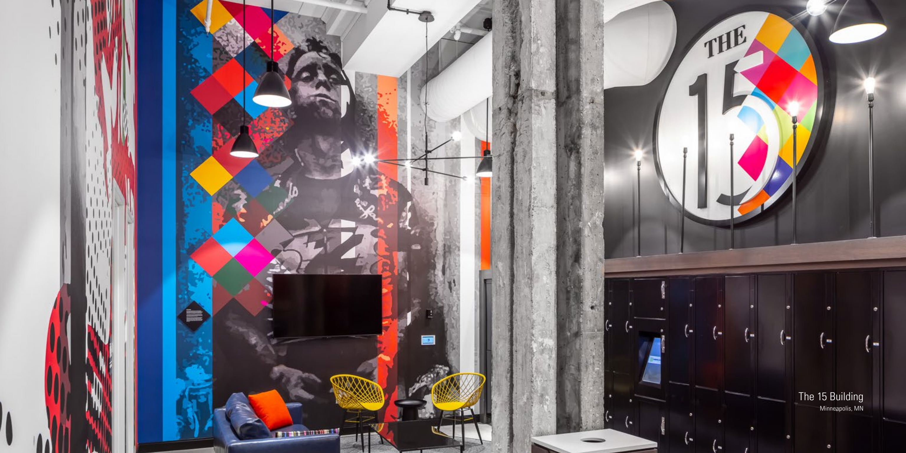
The 15 Building Minneapolis, MN