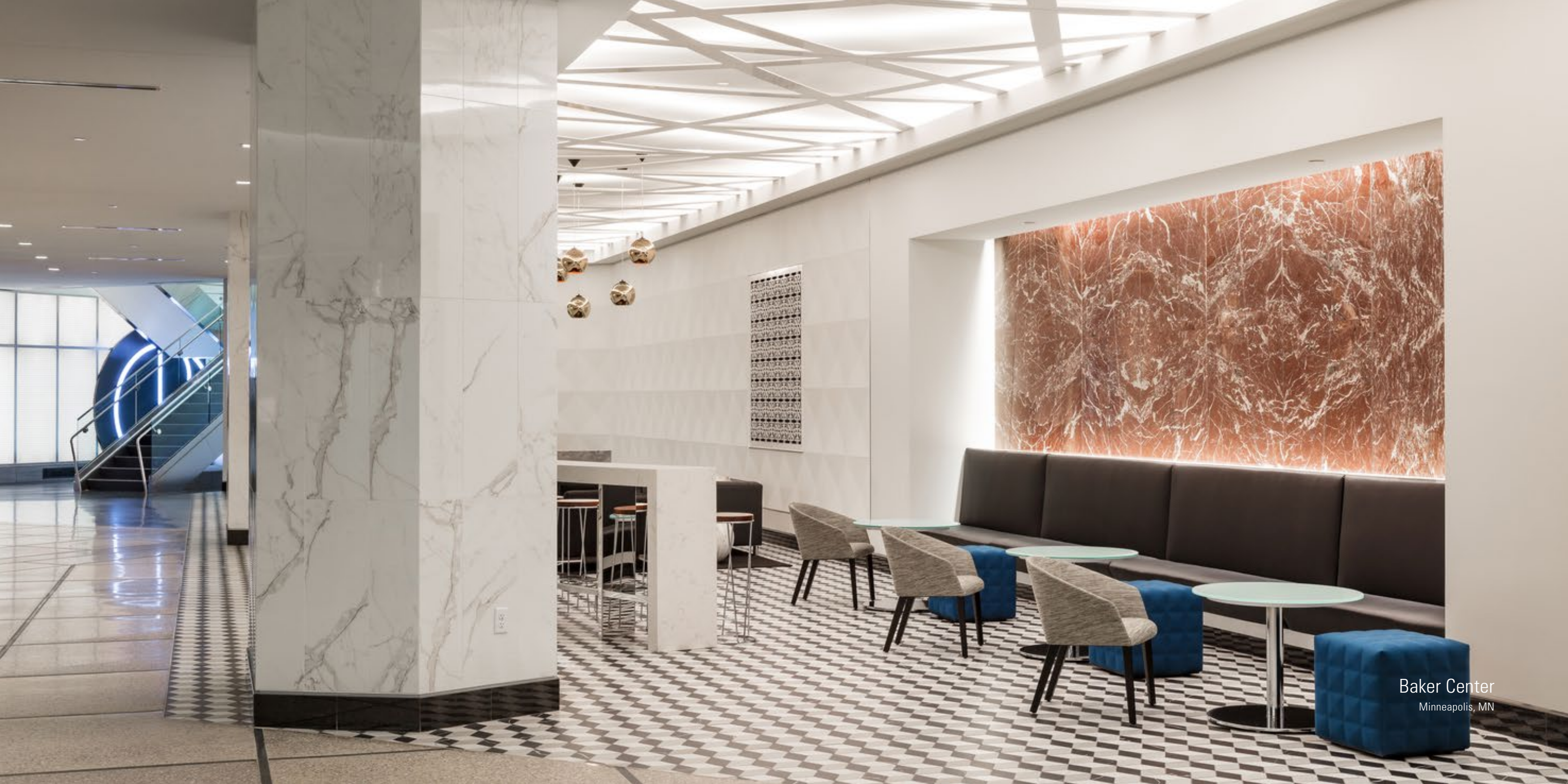
Baker Center Minneapolis, MN